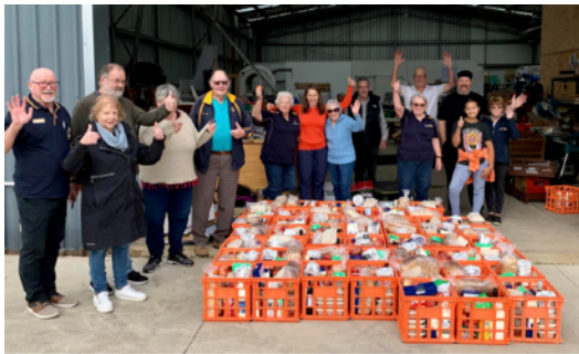
Our Happy Packing Crew

In the days leading up to ANZAC day, members packed 50 hamper which were distributed to local veterans