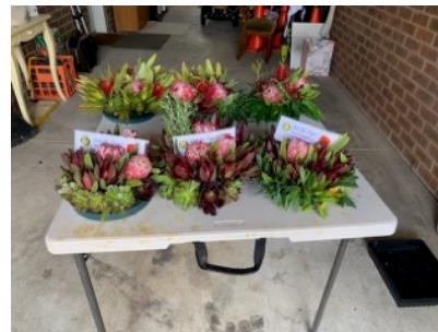
ANZAC day wreaths

An added bonus to the day was that we collected over $500 in donations !