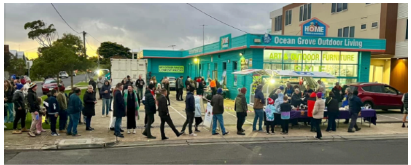
Form a queue please !

Driftwood Cafe, OG Cellars, Ian Pattison Jewellers, Piping Hot Chicken Shop, Viewpoint Digital Media, OG Bar, Wardrobe by the Sea, Bellarine Eye care, Bay IT, Bells by the Beach, Laminar, OG Hardware, OG NewsXPress, Pavilion Property, Ocean Eyes, OG Super Toys, Covenant Wine Bar, Roche Accounting, Bakers Delight