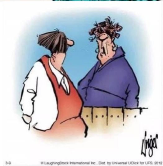
"He was very romantic when we first got married, but you know how men change."