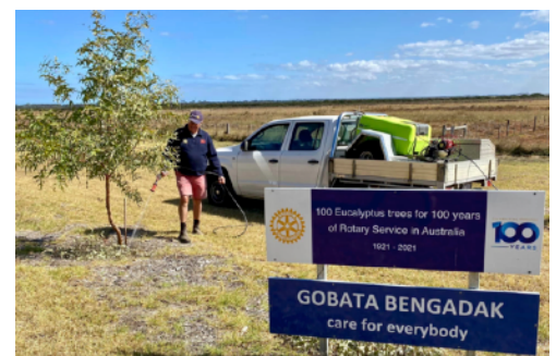
Rod on the job

Next Meeting: Please remember to bring along a pen ! You'll need it for an activity.