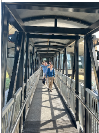
On the ramp to the ferry

Lunch & Sail: It was a beautiful day and around 22 Rotarians/ partners had a very nice meal at Tarra restaurant and ventured to Sorrento on the 2pm ferry. Some adventurous souls stayed in Sorrento planning to catch the 4pm ferry back to Queenscliff only to be told it wasn't running 😞. Still, another hour in lovely Sorrento wouldn't be that hard to put up with !