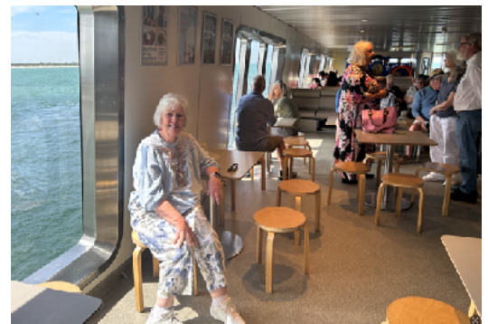
Beautiful day for a ferry trip