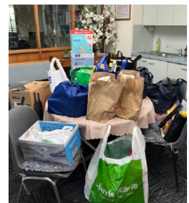
Our Donations so far ...