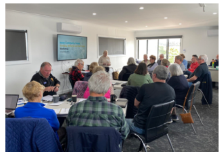
Rotarians hard at work at the weekend Community Group Meeting

8 members did not report their age group.