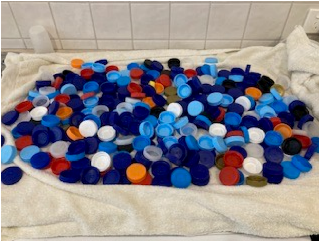
Bottle tops collected